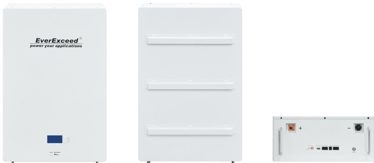
EverExceed 48V Wall mounted Solar lithium iron phosphate (LiFePO4) battery.

*Communication matching other brands of inverters can be customized