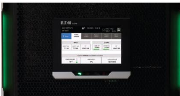
Green light bars showing healthy UPS.